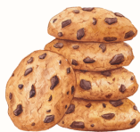
Cookies (Crumble & UKC themed)