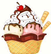
Lizzie's Ice Cream (Chocolate & Vanilla)