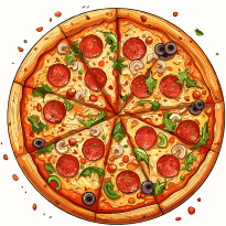
Pizza (Gluten Free & Vegan options)