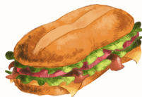
Subway Sandwich Slices